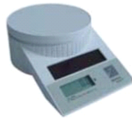
Solar Electronic Scales