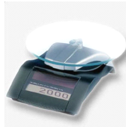
Solar Electronic Scales