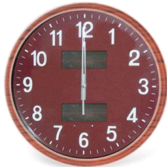
Solar Wall Clock