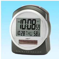
Solar Desk Clock Thermometer